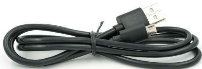
USB TYPE-C CABLE